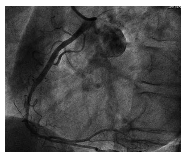
Figure 4. Right coronary artery after successful PCI with stent implantation and restoration of TIMI 3 flow